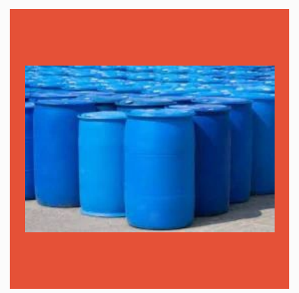
Concrete Demoulding Agent