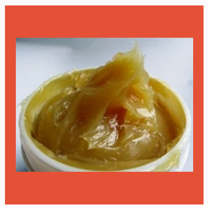
Lithium Greases .