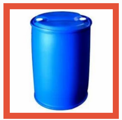
Solar Fluid for Stainless Steel