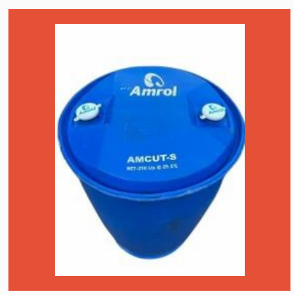
Cutting Oil for Stainless Steel