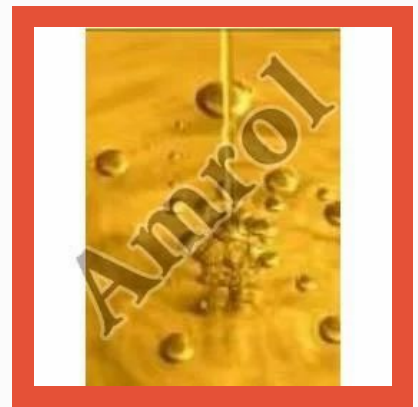
Rubber Process Oil