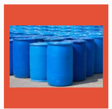
Knitting Oil .