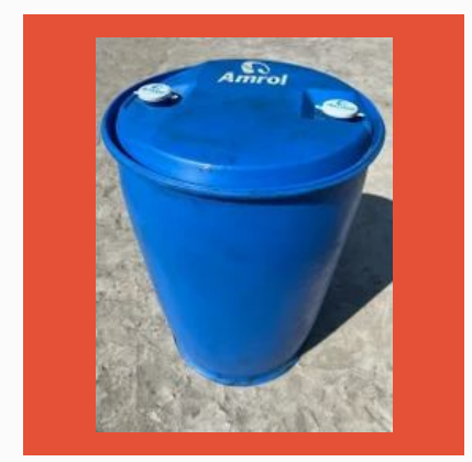
Synthetic Heat Transfer Fluid