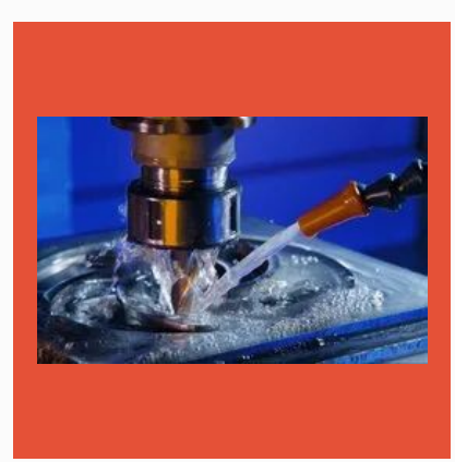
Synthetic Cutting Oil