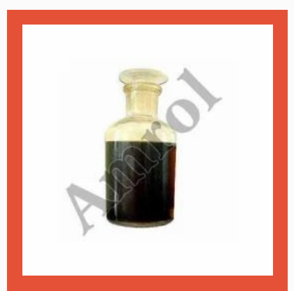
Sodium Petroleum Sulfonate