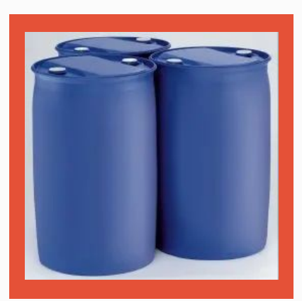
Soluble Emulsifier for Cutting Oil