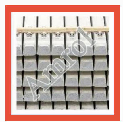
Concrete Mould Release Oil