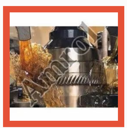
Neat Cutting Oil