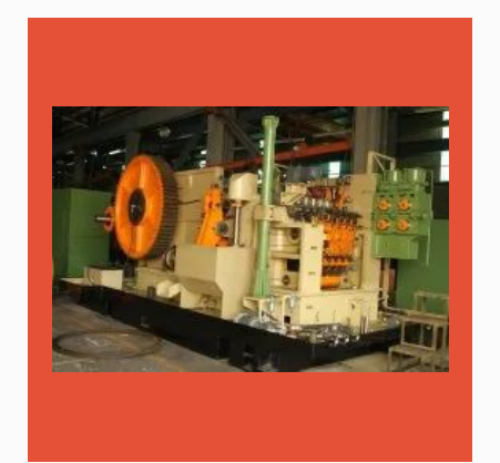
Nut Forming Oil