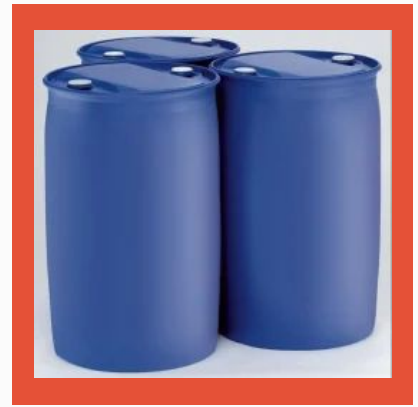
Wool Batching Oil