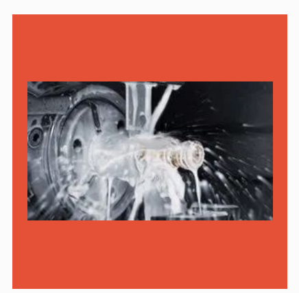
Soluble Cutting Oil