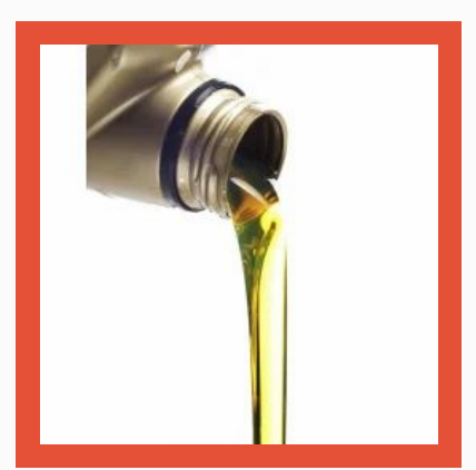
Engine Oils .