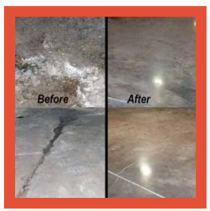
Concrete Hardener ..