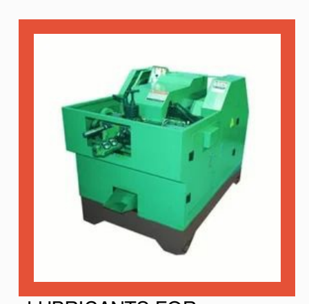
LUBRICANTS FOR IMPORTED HEADERS