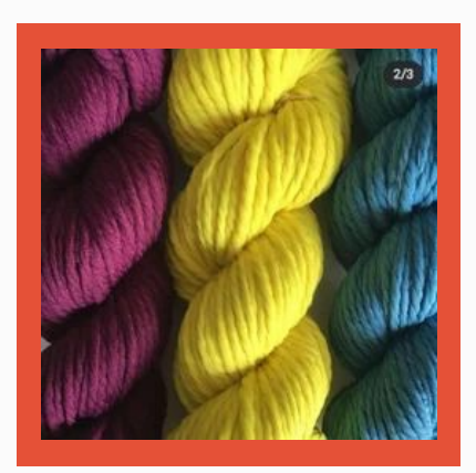
Wool Batching Oil .