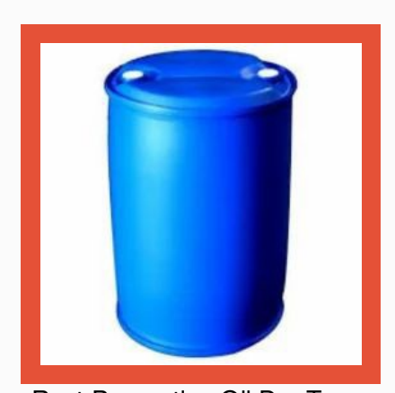
Rust Preventive Oil Dry Type