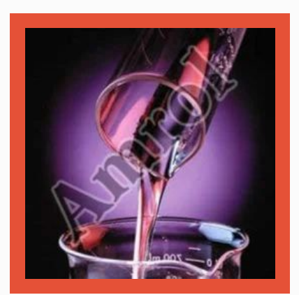
Semi Synthetic Cutting Oil