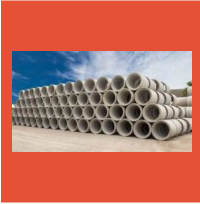
Concrete Demoulding Oils