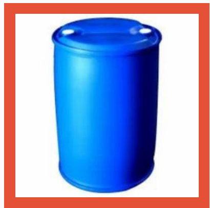
Lubricant Oil for Stainless Steel