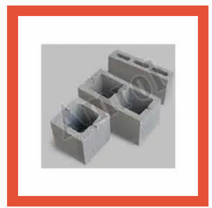
Mould Oil Concrete