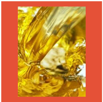
General Purpose Lubricating Oils