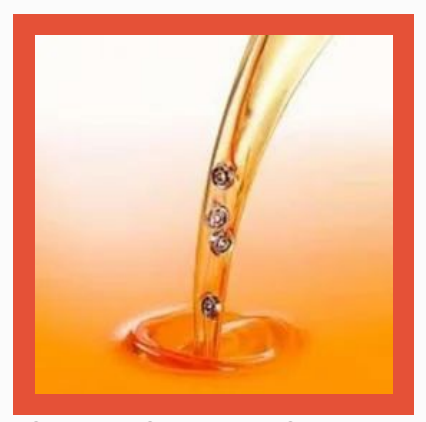
Oil Base Shuttering Oil