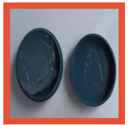
Rubber Mould Release Agents