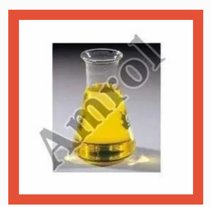
Pine Oil Emulsifier